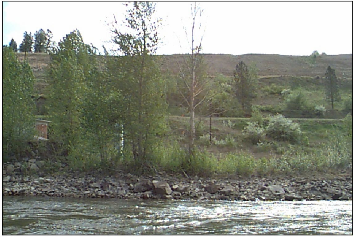
LEFT BANK VIEW