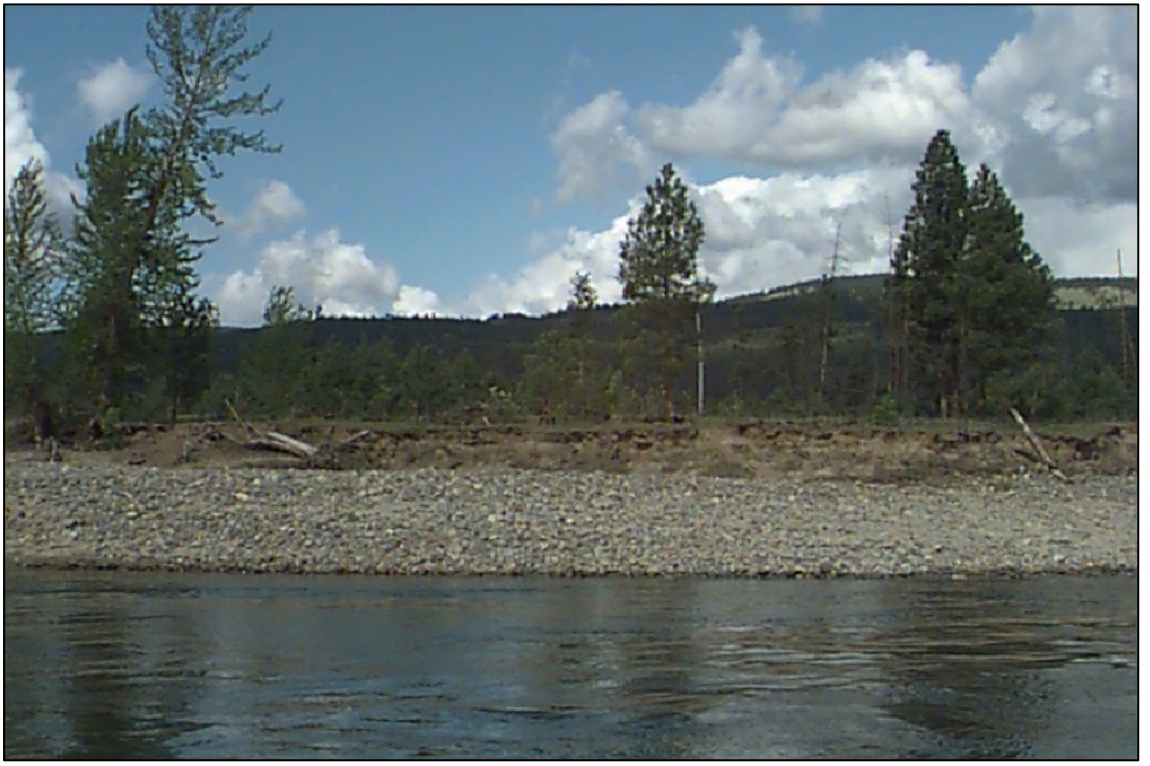
RIGHT BANK VIEW